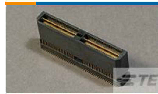
TE Part # 1-1658016-2 MSB0.80PL16ASY56DP,-,10,VCTY