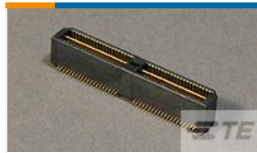
TE Part # 1-1658014-2 MSB0.80PL8ASY56DP,-,10,VCTY