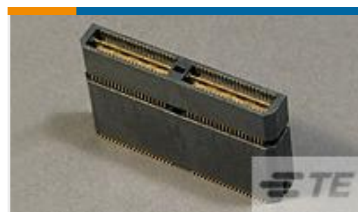
TE Part # 1-1658019-2 MSB0.80PL25ASY56DP,-,10,VCTY