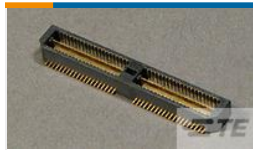
TE Part # 1-1658013-2 MSB0.80PL5ASY56DP,-,10,VCTY