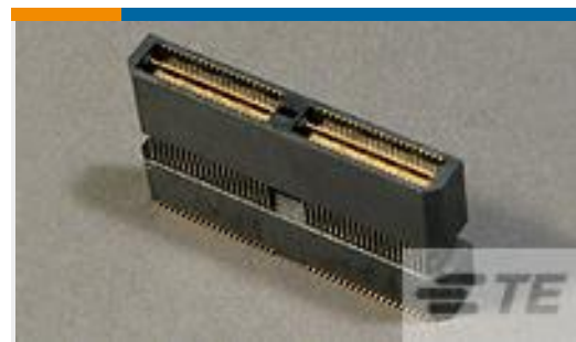
TE Part # 1-1658018-2 MSB0.80PL22ASY56DP,-,10,VCTY