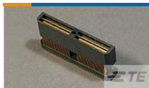
TE Part # 1-1658017-2 MSB0.80PL19ASY56DP,-,10,VCTY