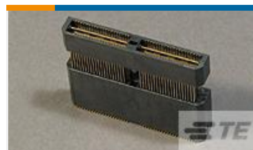
TE Part # 1-1658020-2 MSB0.80PL30ASY56DP,-,10,VCTY