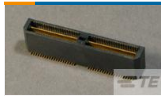
TE Part # 1-1658015-2 MSB0.80PL11ASY56DP,-,10,VCTY